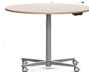
RondoLift 22233/22236/22238/ 22241/22242 Other finishes available.